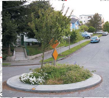
Some people liked the idea of more traffic circles for additional traffic calming, while others disliked the idea