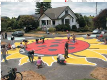
People liked the idea of using intersection art as a traffic calming technique